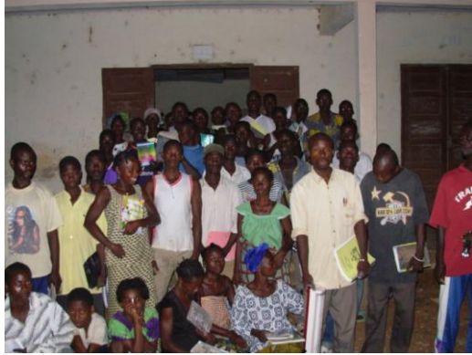
Literacy Students in Ettien's Village

The literacy class in my village has a dynamic and energetic teacher. As a result, the program has grown significantly in the past two years.